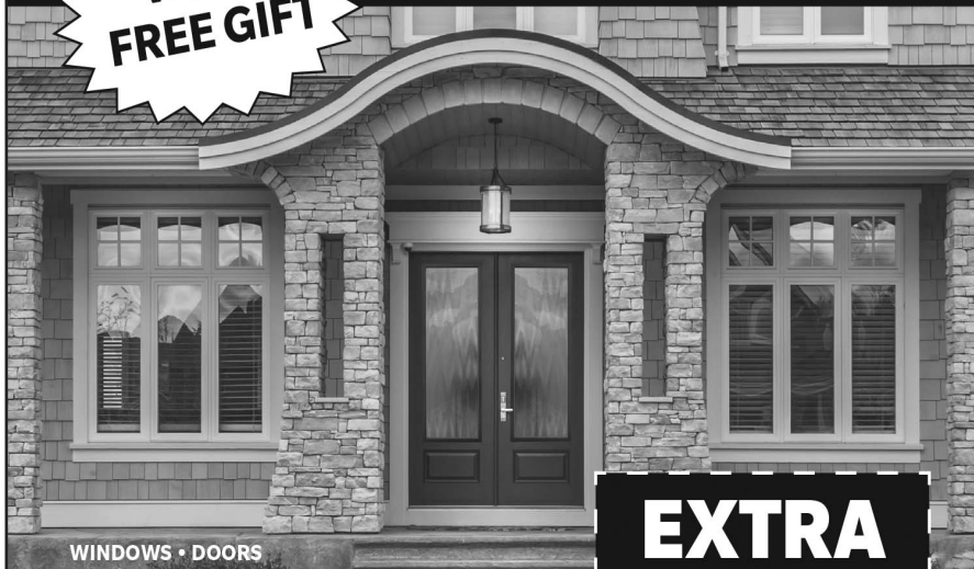
WINDOWS • DOORS